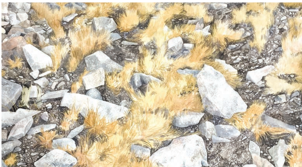
[ Michelle Lassaline: Cirque , Recent Paintings & Drawings Classroom Gallery | December 4, 2015 – March 12, 2016 ]