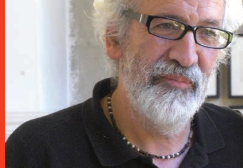
[ Joseba Zulaika | November 7, 2015 ] "Bilbao, Autobiography of a City"