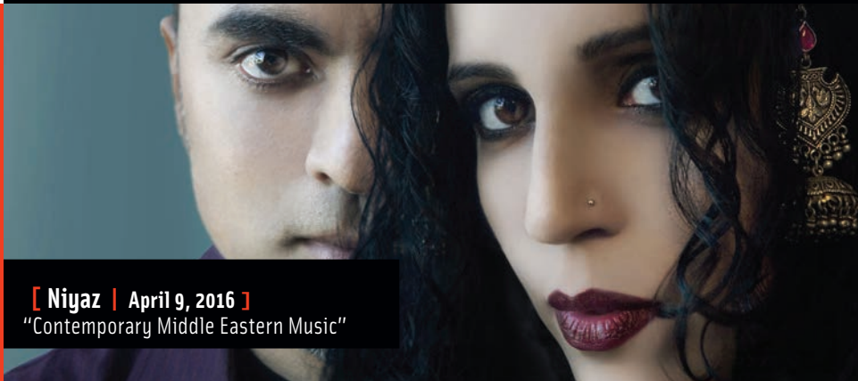
[ Niyaz | April 9, 2016 ] "Contemporary Middle Eastern Music"