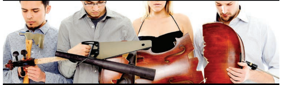
[ Break of Reality | May 14, 2016 ] "Alt-Classical Repertoire for Cello"